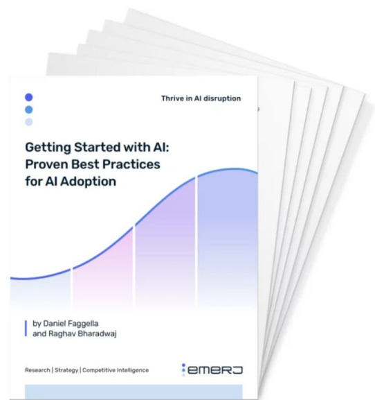
Frameworks and Best-Practices for AI Adoption, Learn More About Our "Getting Started with AI" Report

All claims of "general purpose" AI are faulty, the truth is that novel AI applications are risky and their results are uncertain.